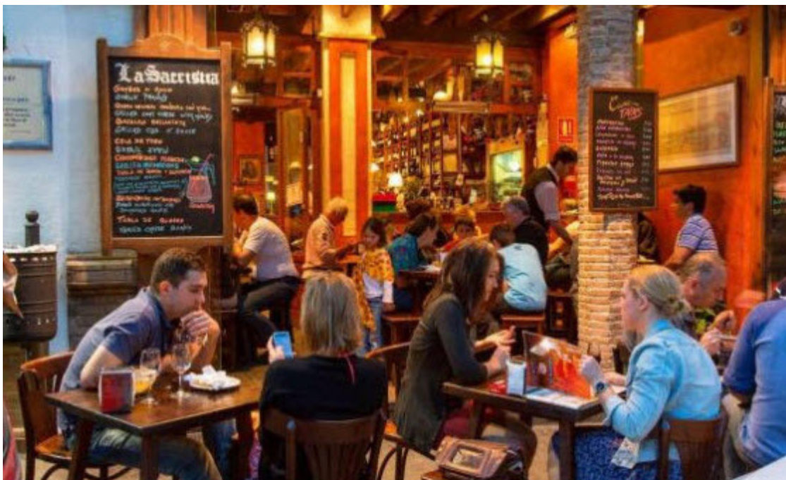
Tapas crawls in the Santa Cruz district

Try the potato salad and prawns from nearby Huelva at Bodeguita Casablanca (00 34 954 224 114; bodeguitacasablanca.com ) and order plates of jamón ibérico de bellota at the old-school Las Teresas (00 34 954 213 069; lasteresas.es ) in the tangle of streets of Santa Cruz. A warm “piripi” sandwich of bacon and ham is another must-eat at Bodeguita A Romero (00 34 954 223 939; bodeguitaantonioromero.com ) near the bull ring.