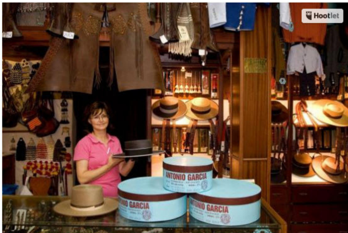
Pick up a sombrero at Antonio Garcia.

Calle Sierpes and Calle Alfonso XIII are the main retail thoroughfares, while upscale shops such as Loewe and Carolina Herrera cluster around Plaza Nueva. For a more local flavour, head down the streets around the San Salvador church, where boutiques such as Antonio Garcia (00 34 954 222 320; sombrosrogarcia.com ) sell sombreros and equestrian goods.