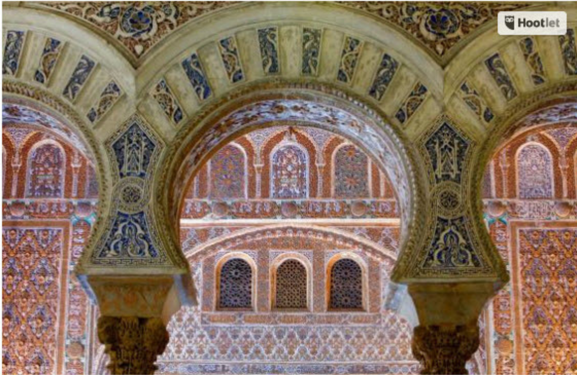
Real Alcázar.

Seville has a new cultural landmark with the new CaixaForum ( lacaixa.es ) on Isla de la Cartuja that incorporates the city's tallest building, the Torre Sevilla. There will be two exhibition spaces, a restaurant and shops. A must-see is Real Alcázar (00 34 954 50 23 24; alcazar-sevilla.org ), the city's royal palace. Dating to the ninth century, it combines Moorish, Gothic and Renaissance styles in its azulejo-tiled rooms with coffered ceilings and stunning gardens.